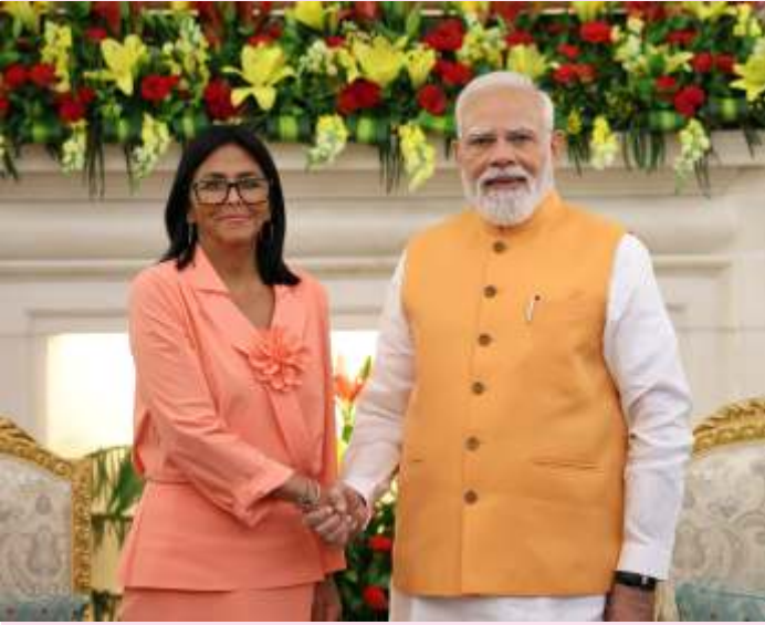
PM meeting with Ms. Delcy Rodriguez, Acting President of the Bolivarian Republic of Venezuela at Hyderabad House, in New Delhi.