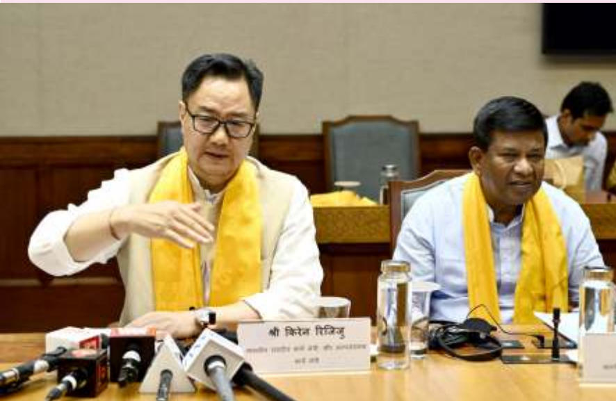
Shri Kiren Rijiju addressing a press conference after the signing ceremony of the Memorandum of Understanding (MoU) for implementation of the National e-Vidhan Application (NeVA) in the West Bengal Legislative Assembly at Parliament House, in New Delhi