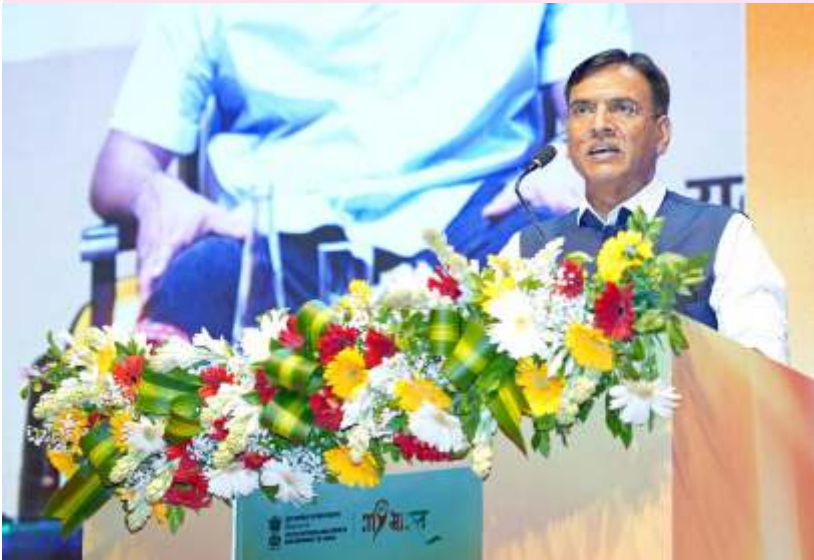
The Union Minister of Labour & Employment and Youth Affairs & Sports, Dr. Mansukh Mandaviya addressing at the 'Youth for Viksit Bharat - MY Bharat Youth Convention' event, in New Delhi.