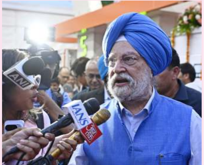
The Union Minister of Petroleum and Natural Gas, Shri Hardeep Singh Puri interacting with media during the launch of E85 Fuel, in New Delhi.