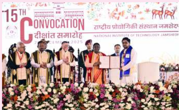
The President of India, Smt. Droupadi Murmu graced the convocation ceremony of NIT Jamshedpur, in Jharkhand on December.