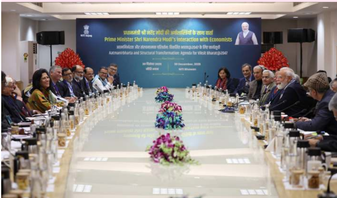
PM interacts with Economists at NITI Aayog, in New Delhi on December 30, 2025.