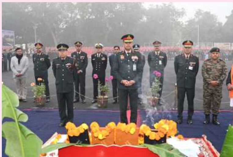
NCC Republic Day Camp 2026 Commences with Sarv Dharm Pooja at Cariappa Parade Ground, in Delhi Cantt.