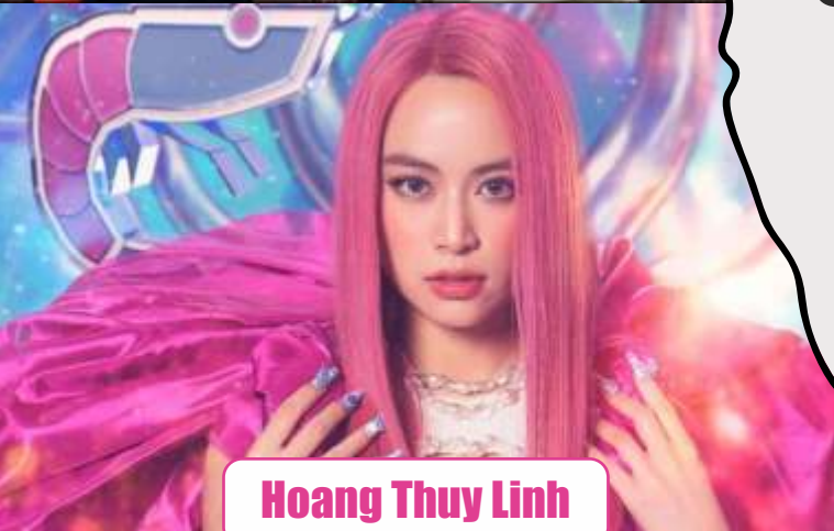
Hoang Thuy Linh

The Vietnamese pop sensation behind See Tinh, bringing the new wave of V-pop and Vietnam's cultural charm to the world.