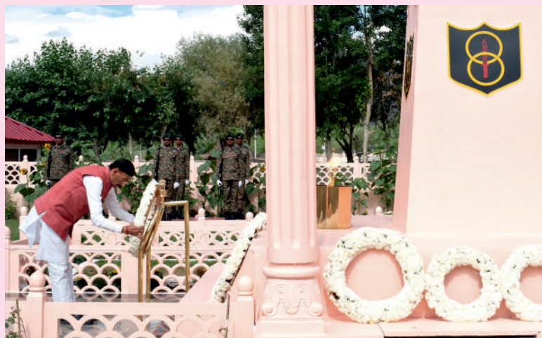
The Raksha Rajya Mantri, Shri Sanjay Seth laying a wreath at the Kargil War Memorial, Dras on the occasion of Kargil Vijay Diwas in Ladakh.