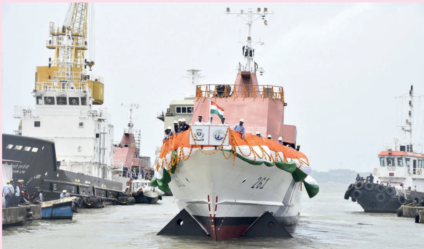
Goa Shipyard launches ICGS ATAL – the Sixth Fast Patrol Vessel for Indian Coast Guard, in Goa.