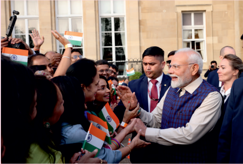
PM receives a rousing welcome by Indian community on his arrival at London, in United Kingdom.

The Union Minister of Road Transport and Highways, Shri Nitin Gadkari addressing at inaugural event of the International Sugar Expo 2025 at the 83rd Centennial Annual Convention of STAI at Bharat Mandapam Convention Centre, in New Delhi.